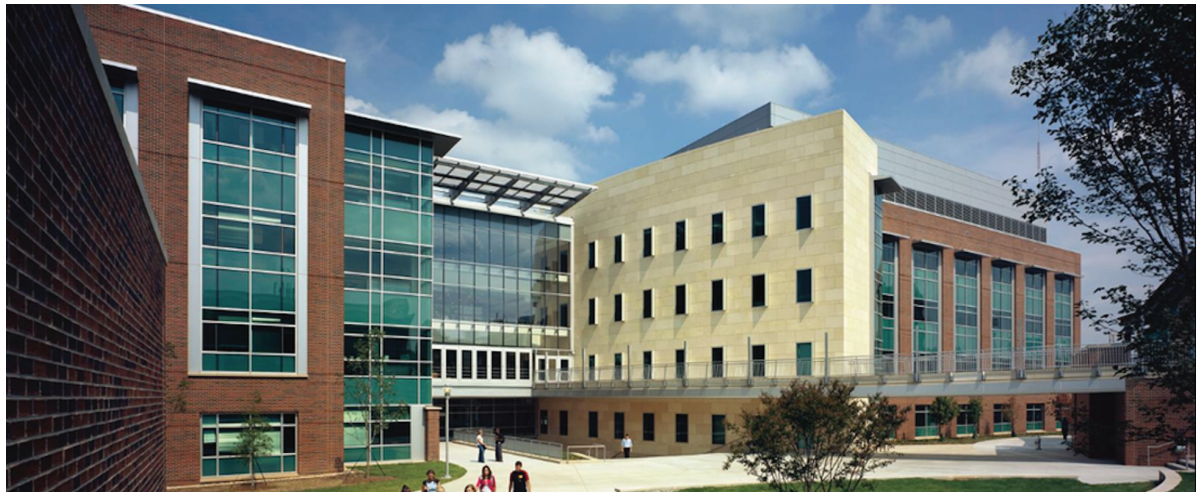
The REVEALS project is headquartered in the Molecular Science and Engineering Building on the main campus of the Georgia Institute of Technology in Atlanta, Georgia. Additional facilities are located at the partner institutions.